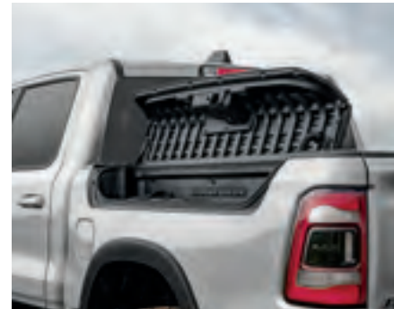
Available RamBox® System

The available Uconnect® 12.0 with navigation 2 features a large, advanced 12-inch touchscreen. A customizable home screen with split-screen capability and pinch-to-zoom technology makes it easy to access what matters.