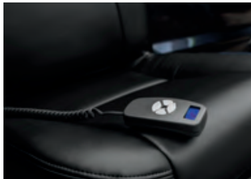
Transfer Seat Control Pad*

The Ram 1500 offers an available, 395-horsepower 5.7L HEMI® V8 engine with the eTorque Mild-Hybrid System. It delivers impressive V8 engine towing of up to 12,750 lb 12 and is paired with a standard TorqueFlite® 8-speed automatic transmission.