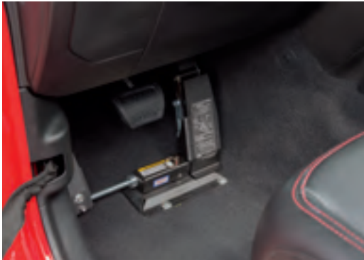
Foot-Control Pedal Extension*

Whether it's scooter hoists, rear or side wheelchair lifts, or outside wheelchair carriers, we have the equipment that's perfect for you, your vehicle and your lifestyle.*