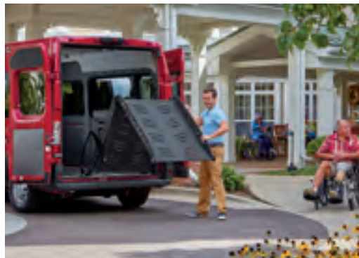
Rear Wheelchair Ramp*

The Front-Wheel-Drive Ram ProMaster features a turning diameter as low as 36.3 feet, an impressive cargo height, a wide door-opening width, a low load-in and step-in height, and a wide rear doorway width to accommodate most types of wheelchairs or lift systems. ProMaster is an excellent upfit choice for personal use and for facilities that transport multiple individuals with varying needs. With up to 462.9 cubic feet of cargo capacity, 16 there's ample space for modifications. The standard ParkView® Rear Back-Up Camera 17 helps make navigation in Reverse safer and easier — especially important when passengers are preparing to enter or exit the vehicle through the back door.