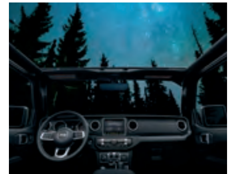
Available Sky One-Touch™ Power Top