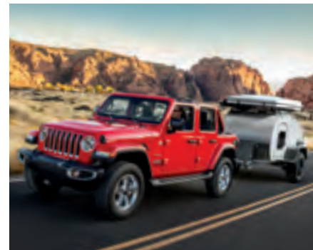
Trailer Sway Control (TSC) 15

A high-strength steel frame creates a solid foundation to help maximize crash protection, while an advanced air bag 14 system is ready to be deployed when needed.