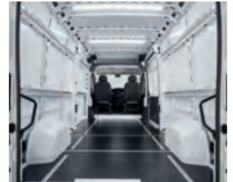
Expansive Cargo Width