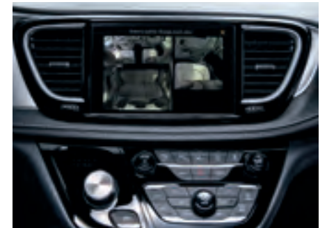
Available FamCAM™ interior camera with automatic day and night modes