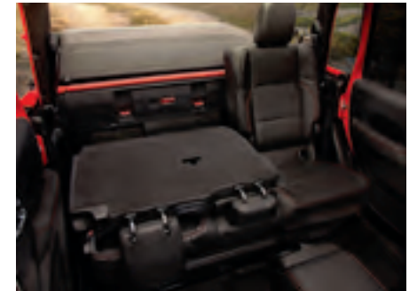
Flexible Rear Seating