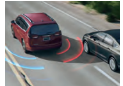
Available Blind Spot Monitoring 11