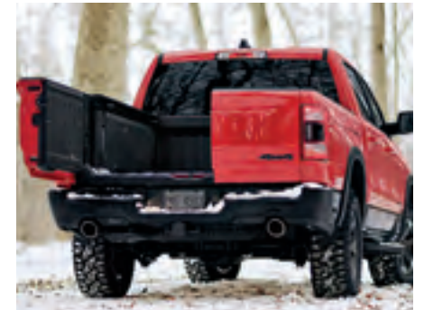
Available Multifunction Tailgate