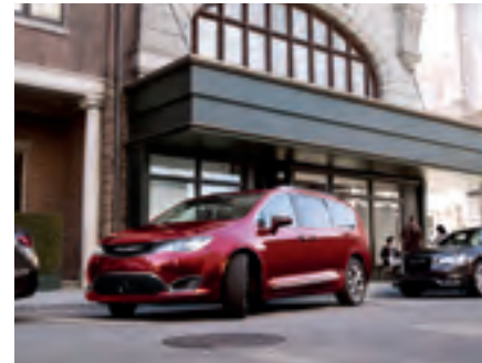
Available Parallel and Perpendicular Park Assist 3

A new generation of family utility brings compatible new technologies and introduces an available All-Wheel-Drive system for enhanced driving capability. The lineup boasts the most standard safety features in the industry 8 to help make every ride more secure.