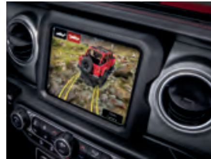
Available Forward-Facing Off-Road TrailCam Camera 3

Upfit your lifestyle with Jeep® Gladiator's clever functionality and versatility, advanced capability powertrains, intuitive technologies, and the open-air freedom of lightweight removable doors, soft top or hardtop along with abundant flexible storage.