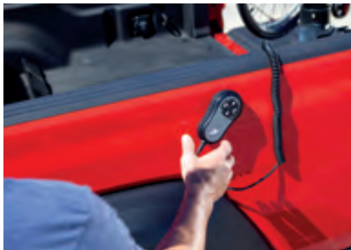
Hoist Lift Hand Controller*

The Jeep Gladiator is engineered from the ground up to be a true pickup truck — ready to carry you and your gear around the corner or to the far corners of the earth.*