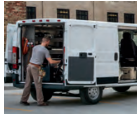
Convenient Low Load-Floor Height 12

Your peace of mind is our top of mind. That's why the Ram ProMaster® has been designed with a solid, unibody frame that incorporates high-strength steel and numerous standard and available safety and security features.