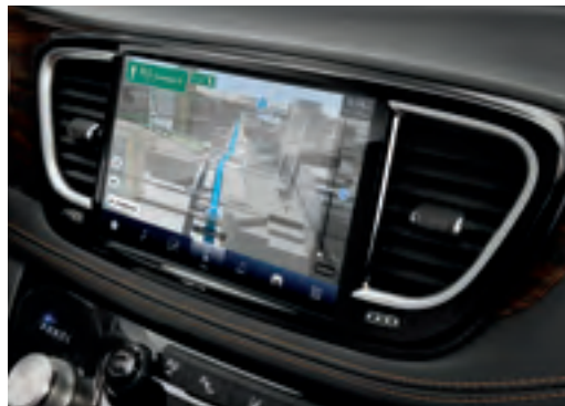
Available Uconnect® Navigation 2

Pacifica offers over 115 standard and available safety and security features, including available ParkSense® Front and Rear Park Assist 3 , available Parallel and Perpendicular Park Assist 3 , Adaptive Cruise Control with Stop and Go 4 , and Full-Speed Forward Collision Warning Plus 5 , a feature that automatically will apply emergency braking if needed.