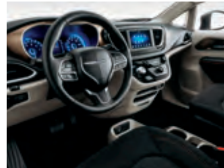
Spacious front-seat leg room allows for enhanced mobility equipment

Rear- and side-entry conversions offer a wider entryway and more interior space, with an enhanced ramp securement system, passenger-seat flexibility and plenty of room for even the largest power wheelchairs and scooters.